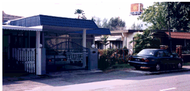
MODERN MALAYSIAN STREET AND MASONRY HOUSING

The post World War 2 period in Malaysia saw the demise of the traditional wooden architecture and the rise of masonry. This has also been influenced starting in the pre-war period by the migration into the region of large numbers of Chinese tin and gold miners having their own tradition of masonry. Many of the Chinese who remained after the minerals ran out became merchants and traders and it is probable that masonry was their preferred construction material because of the need to protect their goods and livelihood.