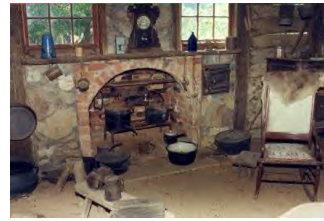
SLAB HUT INTERIOR

With the advent of saw mills and saw milling machinery during the 19 th century masonry construction was supplemented with framed wooden construction. In the northern Australia where the climate is hot this became the most common method of housing construction and many houses were built in a very characteristic style called the “Queenslander”. This house is characterised by being raised on high (1.5m or more) wooden piles called stumps because they were formed from pieces of naturally shaped tree literally tree stumps. Typically the house will be surrounded with verandas providing shade to the outside walls and windows. The wooden frame of the house will be clad with wooden planks and will often have a corrugated iron roof. There will usually be fairly large windows opening to provide good ventilation and the ceilings will be around 3m high. The “Queenslander” house is designed for the hot climates. In the southern cooler states wooden framed and clad houses were also common but were usually set on low wooden or brick foundations. There they are designated weatherboard houses. Weatherboard houses were cheaper to construct than masonry houses and were therefore considered inferior to the masonry house. In many parts of Australia they comprised the houses of the poorer sections of the population.