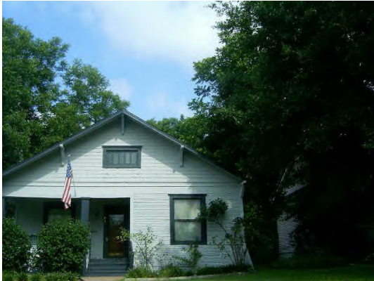
OLDER STYLE WOODEN NORTH AMERICAN HOUSE

around 55% of the total new cladding market in the USA. [James Hardie Market Projections from Annual Report].