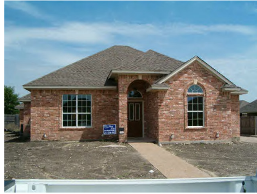
MODERN SINGLE STOREY NORTH AMERICAN HOUSE