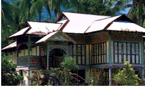
TRADITIONAL MALAY KAMPONG (VILLAGE) HOUSE