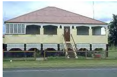
QUEENSLANDER STYLE HOUSES

In the twentieth century two variations on the wooden framed house were recognised – the brick veneer house and the fibro house. In these houses the construction method is basically the same as the weatherboard house – a wooden frame is set on foundations and the house is constructed around the frame. The fibro house is clad with asbestos cement (or more recently with Cellulose cement) sheets while the brick veneer house is clad with a single skin of bricks in imitation of the more expensive double brick or solid masonry.