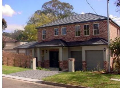
MODERN BRICK VENEER HOUSE

In Australia currently there is a hierarchy of preference in building styles that is as follows