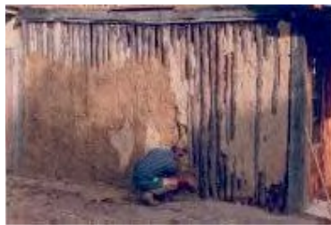
WATTLE AND DAUB CONSTRUCTION

The other buildings of a reasonably permanent nature were built using a technique called “wattle and daub”. Thin branches are woven into flat walls and plastered with mud. Again such structures were probably roofed with bark thatch and had dirt floors. One of the oldest surviving European buildings in Australia is a stone cottage with a slate roof that was built in 1816.