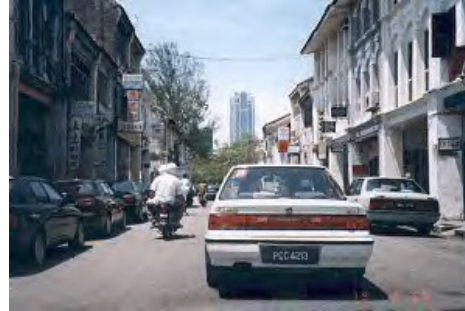
MALAYSIAN SHOP HOUSES AND STREET

There are of course traditions of masonry construction in other parts of Asia that would have influenced the locals. However, these do not seem to have been common and it may have been that the unstable soils and the high rainfall in the region that makes masonry more difficult to construct, militated against that form of construction.